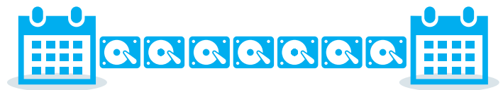
Hard drives in a NetDVR-II travel ~1/2 million miles every year