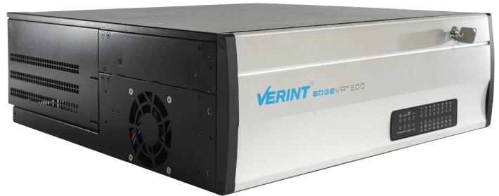
Upgrade to Verint EdgeVR™ 300

Verint EdgeVR solutions enable fraud transaction investigations and face recognition of fraudsters across all sites. This makes it easy to search and identify patterns of suspicious activity. Advanced Fraud Tools are unavailable on the NetDVR-II.